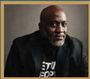
Desmond Meade Civil Rights Activist