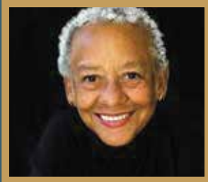
Nikki Giovani Poet, Writer, Teacher