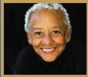
Nikki Giovani Poet, Writer, Teacher